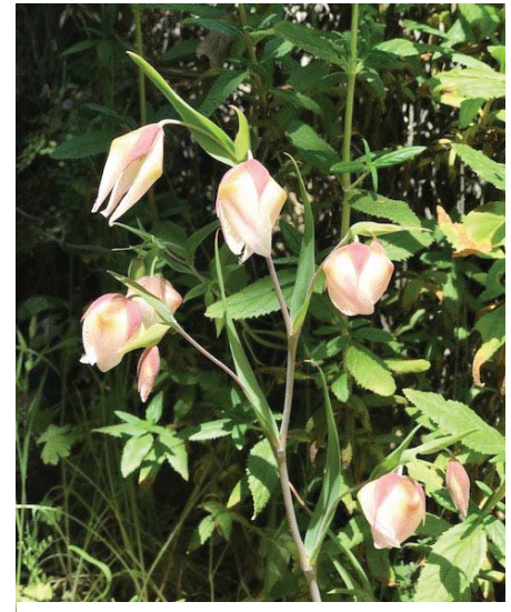
Photo: 2019 is a banner year for Fairy Lanterns!

Anyone interested in learning more about this volunteer role should send an email to: \underline{Newsletter\text{-}Editor@friendsofedgewood.org}