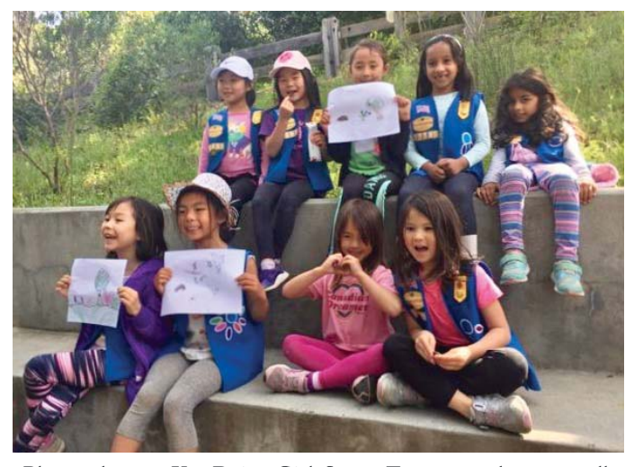
Photo above: K-1 Daisy Girl Scout Troop members proudly display artwork depicting their experiences on a field trip to Edgewood on April 14. The girls in the troop were earning their hiking badges that day, and they did so with great enthusiasm!