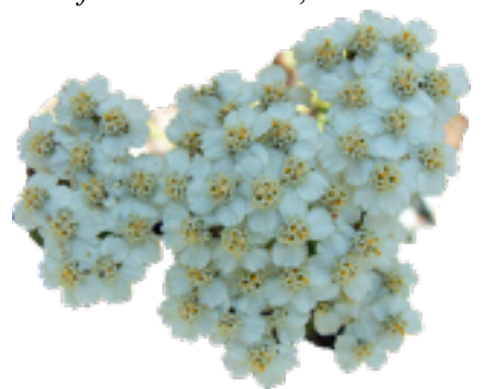
Yarrow, Common; Achillea millefolium