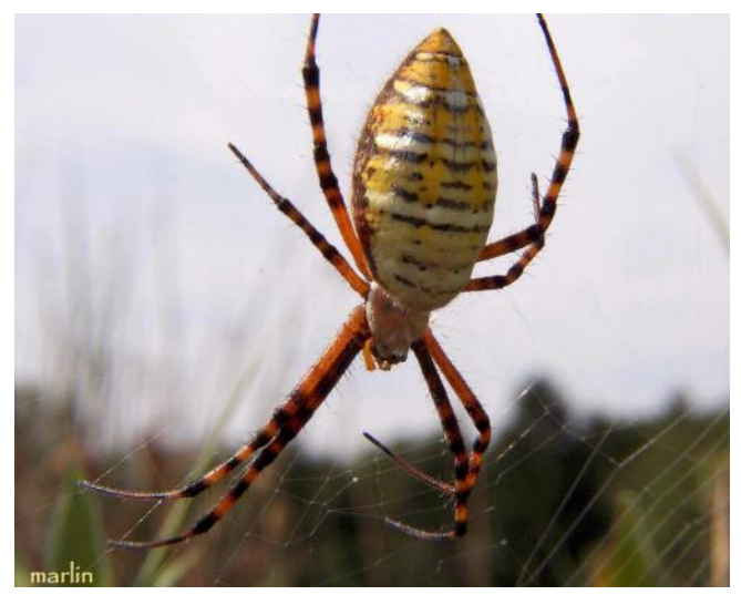
Silver Argiope

The silver Argiope, Argiope trifasciata , is nearly as large as the black and yellow garden spider. In Edgewood it my even appear to be larger in some specimens. Also occurring from coast to coast, this species tends to live near marshes in the east. It matures later, usually around September 1. The egg cases are light gray with one side flattened. This species tends to open up a space in the grass where the web is spun, like a ball-shaped cavity.