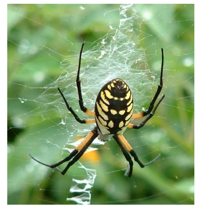
Black and yellow garden spider

With the possible exception of the Bay checkerspot butterfly, many people think only of the large vertebrate animals when they think of the wildlife of Edgewood. In fact, the majority of animal species in the park are insects and other arthropods. They are also the most numerous.