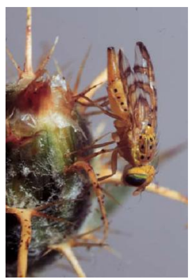
False peacock fly, Chaetorellia succinea