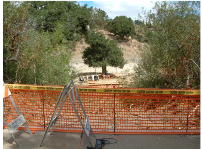
Construction under way September 2005

Well, it doesn't look much like an interpretive center yet, but we do have a much more attractive and useful entrance to Edgewood at the Day Camp now that the outer parking lot and pedestrian bridge have been completed.