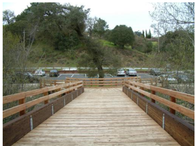
Construction completed February 2006

This work, begun in mid-2005, now provides 25 striped parking spaces in the outer lot, which is paved with a pervious asphalt to reduce drainage into Cordilleras Creek.