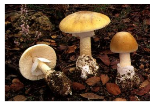
Death Cap (Amanita phalloides)

Edgewood for culinary purposes. Although damaging or collecting plants or other natural objects is