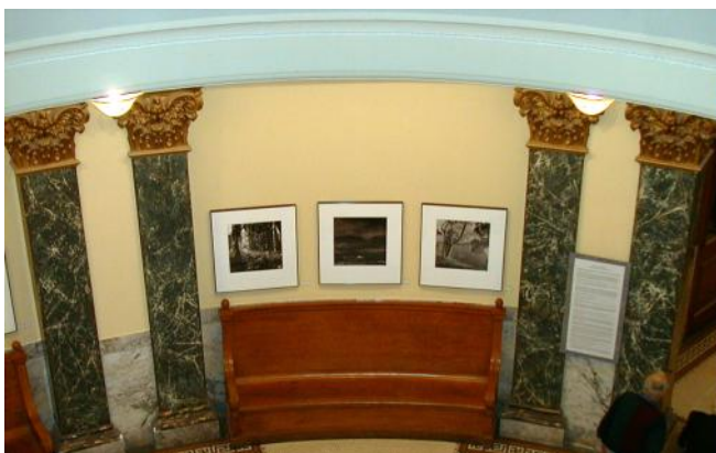
Photos currently on display in Museum's rotunda

Time is running out! All photos must be postmarked by June 30.