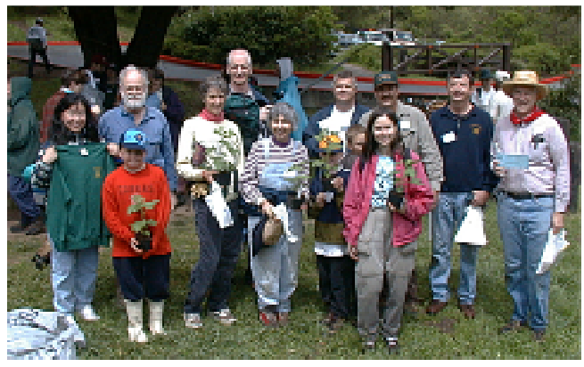
The lucky raffle prize winners